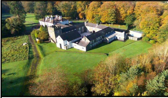
Pictured above is Tobar Mhuire retreat and Conference Centre