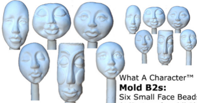
Mold B2 example