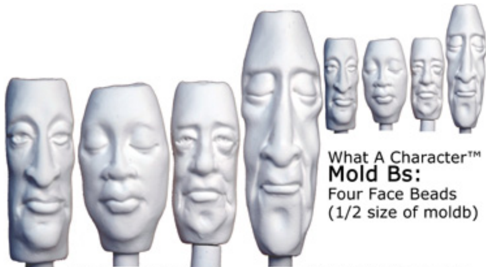
Mold B example