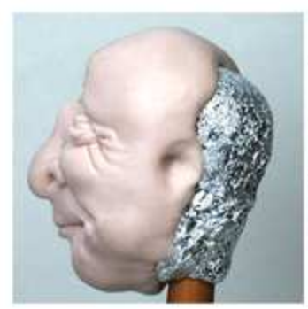
To Make Ears:

Place face over foil egg, pressing gently to fit. It's OK to leave some air space behind the face. This may be especially important if the foil doesn't quite match the inside shape of the face. Don't try to force the clay to match the foil or you'll deform the face.