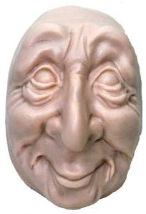
What a Character® Mold F5

A 3 inch whimsical male face (with Optional Ears) designed by Maureen Carlson